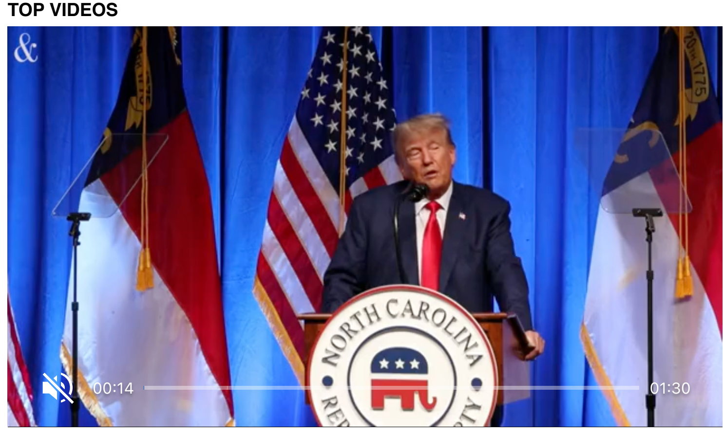
Former President Donald Trump blasts the Justice Department

There's no safe level of lead in the blood and scientists have documented <u>even low</u> <u>levels of lead</u> causing children to struggle with learning and behavior.